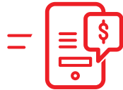
Fintech & Payments