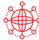
International Business & Investment Law