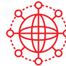
International Business & Investment Law