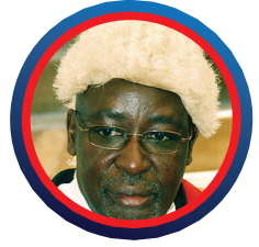
Justice Paul Kahaibale Mugamba Justice - Supreme Court of Uganda