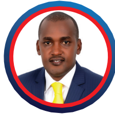
Frank Tumwebazze Minister of Information Technology and Communications in Uganda