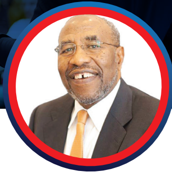
Rt. Hon. Dr. Ruhakana Rugunda Prime Minister of Uganda