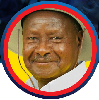
H.E Yoweri Kaguta Museveni President of Uganda