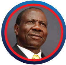
Hon. Matia Kasaija Minister for Finance Planning and Economic Development in Uganda